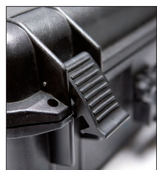
Watertight, shock-proof and robust – the right protection for your machine.

Drill not included with ZHK 1300. Purchase of MAB 1300 drill includes ZHK 1300 case. See page 45 for MAB 825/845 case.