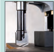
Optional Special-Purpose Cutting Tool