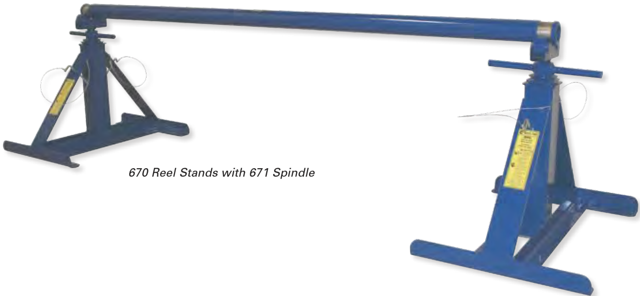
670 Reel Stands with 671 Spindle